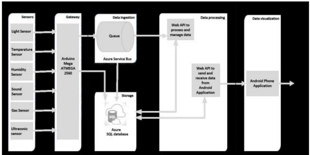
Figure 1 Architectural of Home Environment Monitoring System

The deliverables from this work can be incrementally released by including the addition of one or more sensors with each release. Different sensors are used to measure the different aspects of the home environment monitoring work and as and when newer technology leads to the creation of sensors for other different purposes, this system can be extended to include such sensors.