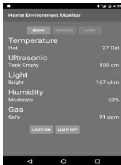
Figure 4 Client Side Android Application

The Android mobile application provides a simple user interface to display the home conditions of the user at his fingertips. It also shows comments as text and the actual sensor values. The user receives push notifications in case of emergency situations such as gas leak and alerts the user when customized requirements are met such as water tank being full and refrigerator being left open. The Application also provides the option to control the home lighting by switching on and off the lights of the home from the mobile application. A screenshot of the mobile application can be seen in the following figure.